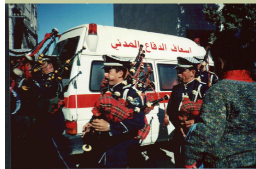
A Palestinian bagpipe band plays carols for Christmas Eve 2000 celebrations in Bethlehem's Manger Square