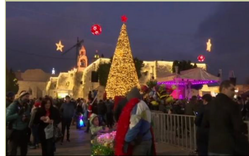
Decorations in Bethlehem for the Christmas Eve 2000 Choral Festival