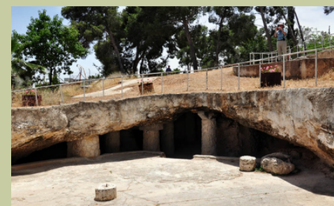
The Shepherd's Cave: Traditional site where the shepherds kept their flocks