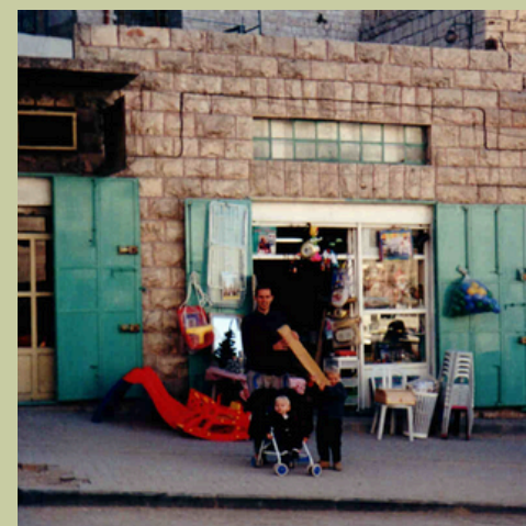
Simons family buying a Christmas Tree in Bethlehem, Christmas 2000